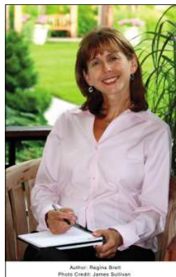
Author: Regina Brett